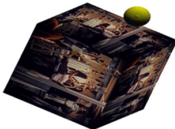
Figure 3. Blending Graphics with Video Played on Surfaces of Rotating Cube